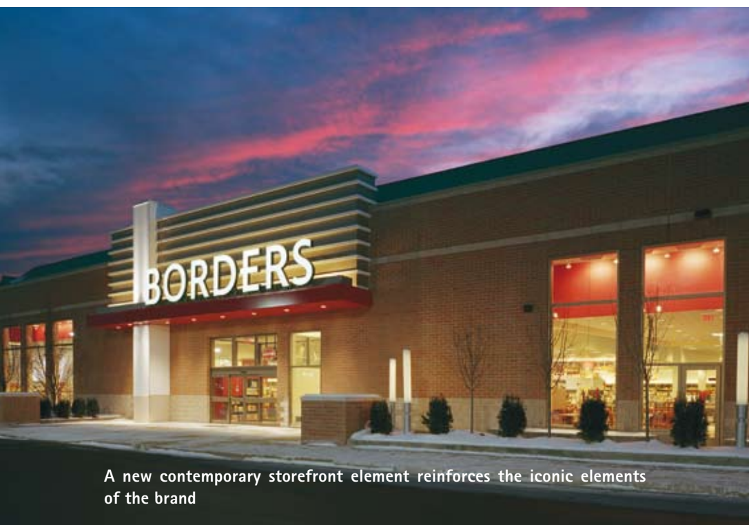
A new contemporary storefront element reinforces the iconic elements of the brand