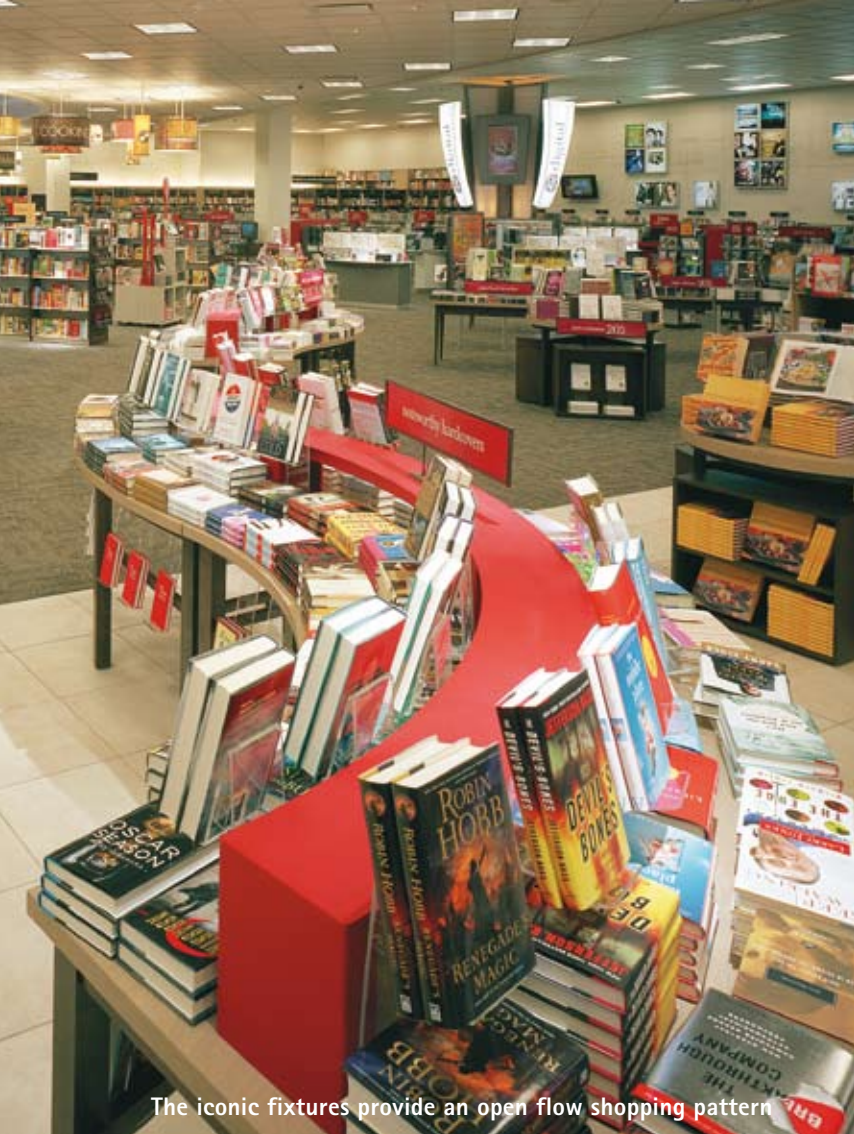
The iconic fixtures provide an open flow shopping pattern