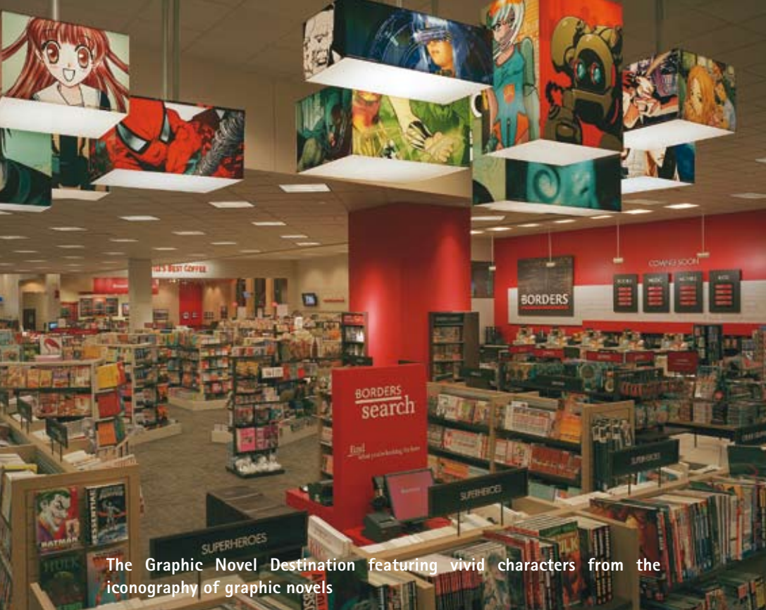
The Graphic Novel Destination featuring vivid characters from the iconography of graphic novels