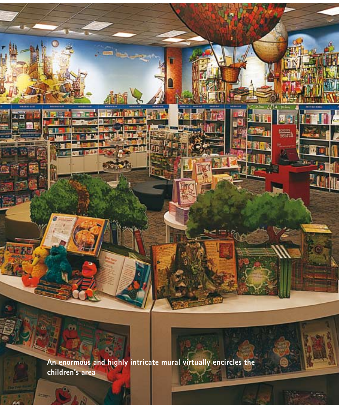
An enormous and highly intricate mural virtually encircles the children's area

low walls to provide a degree of definition and consumer privacy. On either side of the Sprout are the in-store multimedia areas, presented on highly flexible fixtures designed to evolve with this category's ever-changing landscape.