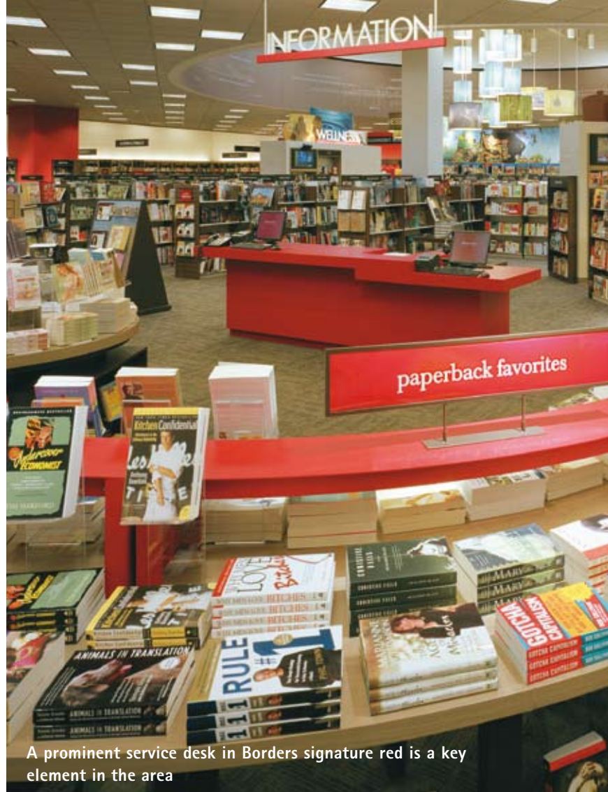
A prominent service desk in Borders signature red is a key element in the area