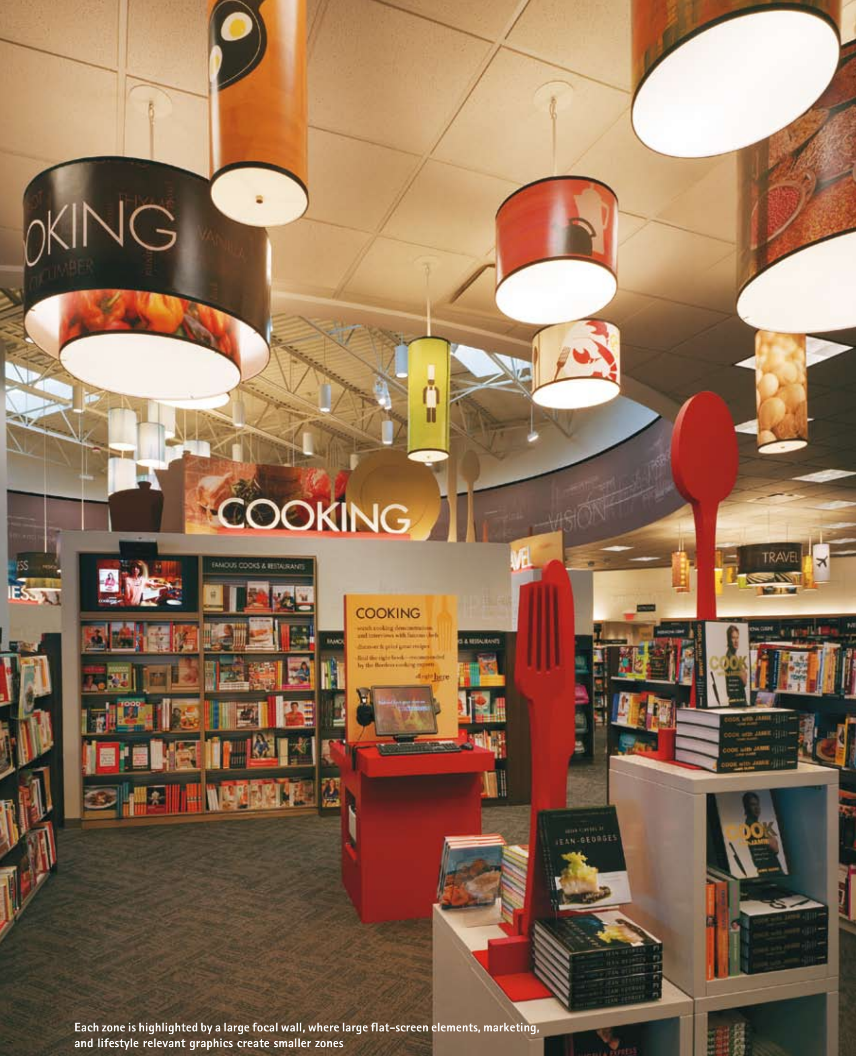
Each zone is highlighted by a large focal wall, where large flat-screen elements, marketing, and lifestyle relevant graphics create smaller zones