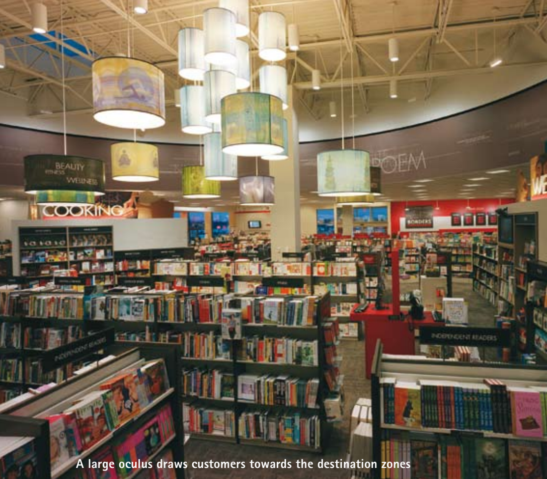
A large oculus draws customers towards the destination zones